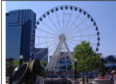
Birmingham Wheel at Birmingham City Centre.

Birmingham is set in the very heart of England with a population in the City of 1,000,000. Today the City of Birmingham combines an historic past with an upbeat modern and vibrant lifestyle for its citizens. Its fine restaurants, superb hotels and fascinating canal systems have all blended superbly with the City's historic buildings and the City Centre boasts the largest shopping mall in Europe.