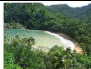
Englishman's Bay, Tobago.

meals, and lodging is $1,400 per person based on double occupancy. Single traveler supplement is an additional $300, or $1,700 total. A block of seats has been reserved on American Airlines; however, you are welcome to book your own air itinerary. For those wishing to travel on the pre-reserved American Airlines, booking a deposit of $600 per person is required, paid by check and at the District 5280 office by January 20 th . The balance of $800 (or $1,100 for single travelers) is due February 20 th for all participants, regardless of whether you've booked your air travel separately. This is also the deadline for accepting travelers. Itineraries, other projects, and more information will be provided as they are finalized. Questions regarding the trip should be directed to Wilson Benitez, 310.791.6233 or wilsonsun@aol.com .