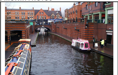
Attend the RI Convention in Birmingham, England this year, and you will better understand the diversity and scope of the organization.